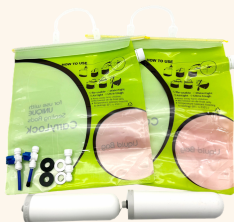
CERAMIC FILTER PACKAGE