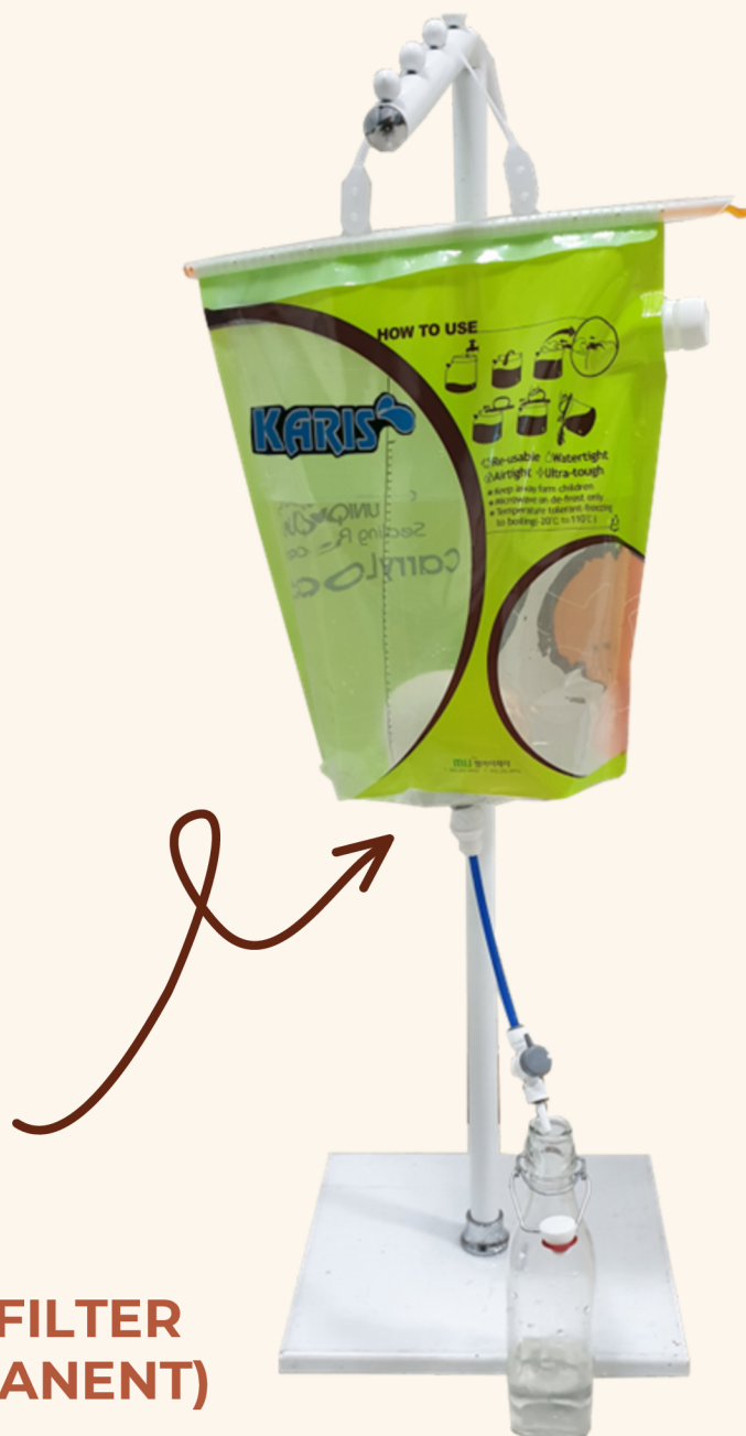
CERAMIC FILTER (SEMI-PERMANENT)